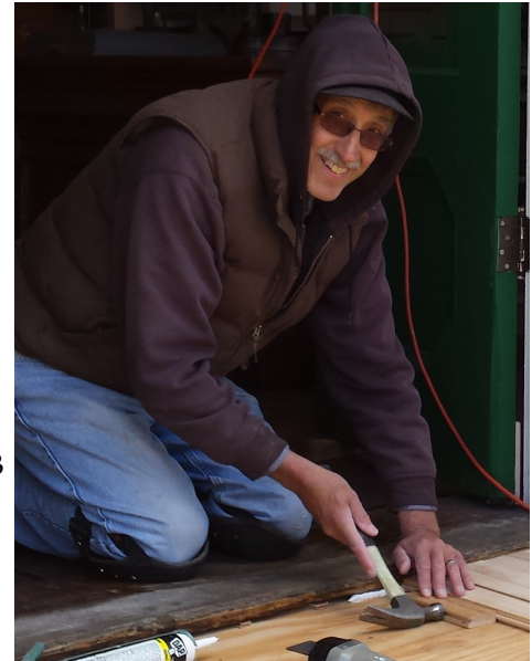
volunteers tackle each year.

There is always a to-do list for repairs for your home and if you multiply that by 33 historic structures, you can get an idea of the projects our buildings and grounds