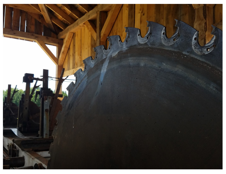
Pictured is the Krueger Sawmill, located south of the arena and Meeme House.

The Krueger Sawmill made its debut during the Mid-Lakes Thresheree on September 12-13, 2020.