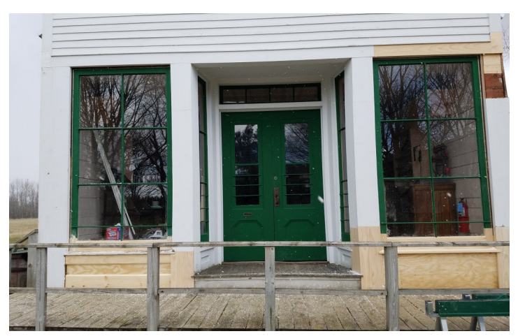
Pictured at top: The Meeme Livery Stable, chicken coop, Meeme House, and Meeme Poll House at the Manitowoc County Historical Society, in summer 2020.

Pictured to the top right: A new brick walkway was installed at the McAllister House Welcome Center.