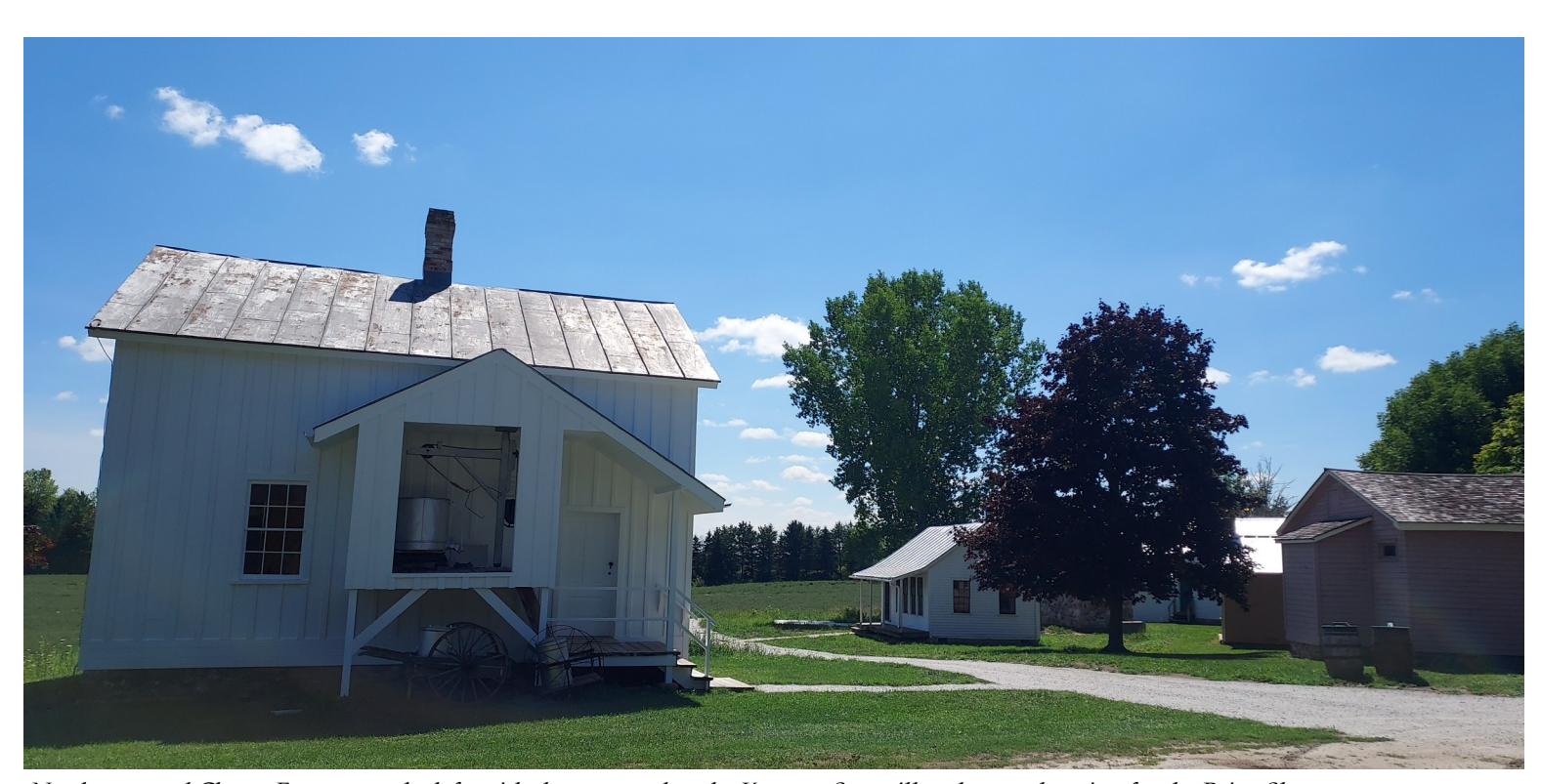
Newly restored Cheese Factory, at the left, with the new road to the Krueger Sawmill and a new location for the Print Shop.

In the little over 20 years that our Cheese Factory has been on site, it has quickly grown to be one of the favorites for our school tours, youth programs, and our annual Thresheree program.