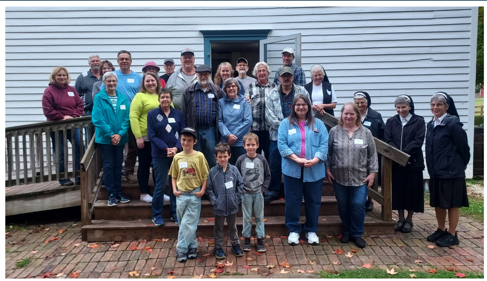
Volunteers gathered outside the Two Creeks Town Hall in September 2023 for the annual volunteer picnic.