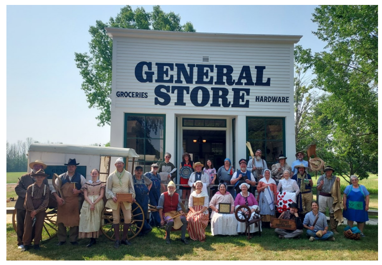
Artists gathered outside the General Store during the Heritage Maker's Market in June.

MCHS, in partnership with Seehafer Broadcasting and WOMT-Radio have a weekly radio broadcast called "Our History Our Story". You can find all of our weekly five-minute podcasts on our website. The podcast brings stories from our museum to life. Be sure to listen to an all new episode of Our History, Our Story every Friday morning at 11:25 on WOMT 1240 AM radio.