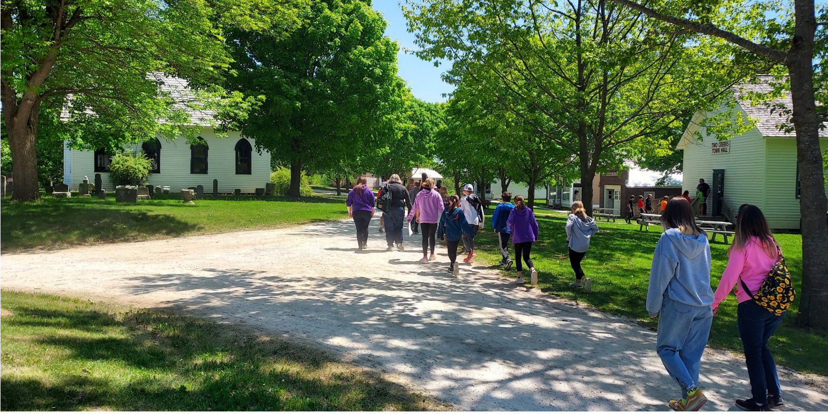
Guests walk the Museum and Village grounds in Summer, 2023.