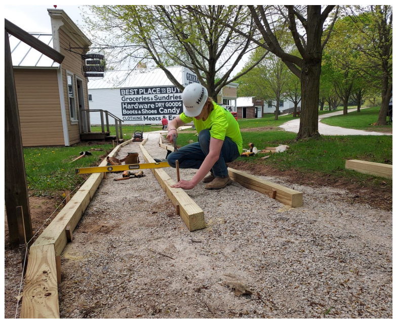
Hamann Construction shared their employees with us for a week to help construct a new boardwalk from our Law Office to our General Store.

As any homeowner knows, a to-do list is never complete – but volunteers and contractors checked a few things off of the list in 2023.