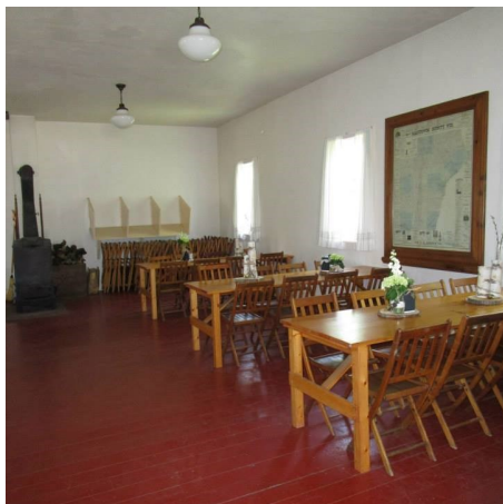
Two Creeks Town Hall

Built in 1893, the Two Creeks Town Hall is a wide open gathering space, perfect for a lecture style set up, a family sit down meal, or a dance. There is a handicap accessible ramp to the front door. The building includes a wood stove for heat, if needed.