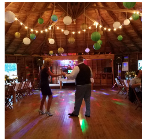
Nennig Dance Pavilion

Capacity: Tent capacity Availability: May through October Venue charge: $1,500