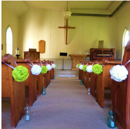
Niles Community Church

The Niles Church, built in 1896, has been the backdrop for gatherings and wedding celebrations for more than a century. The building features historic pews, a woodstove, and the church bell.