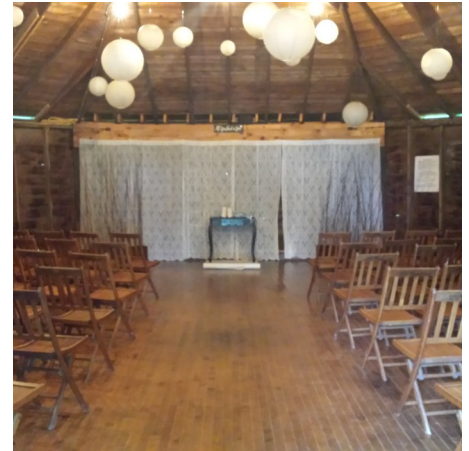
Nennig Dance Pavilion

Capacity: up to 200 seated in chairs and benches Availability: May through October Venue charge: $650