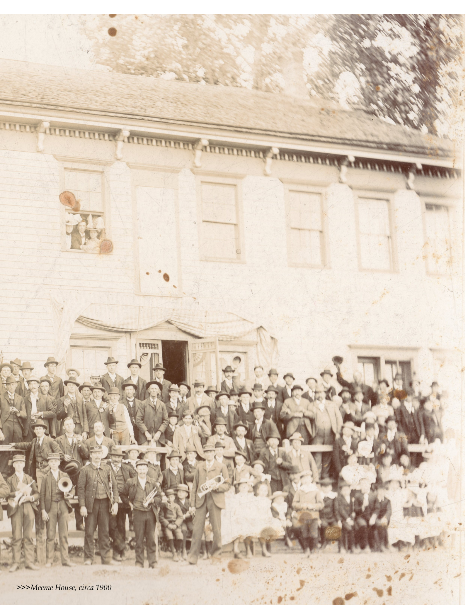
>>>Meeme House, circa 1900