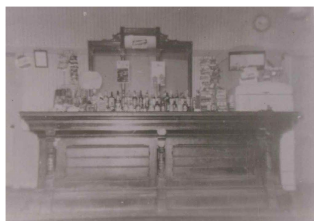
The Meeme Inn bar, circa 1900. This bar piece was recovered inside the contemporary bar structure and will be preserved inside the Inn.