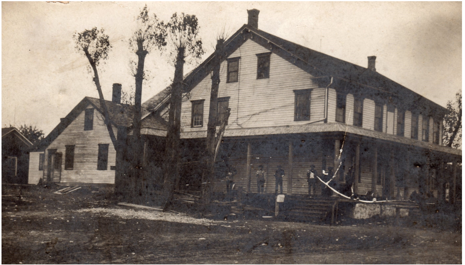
>>>Meeme House, circa 1910