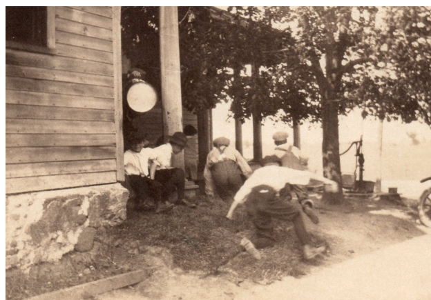
Schwartz children playing on the south side of the Inn, circa 1915.