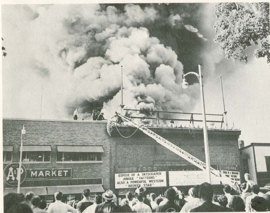
Fighting a Fire on June 11, 1956