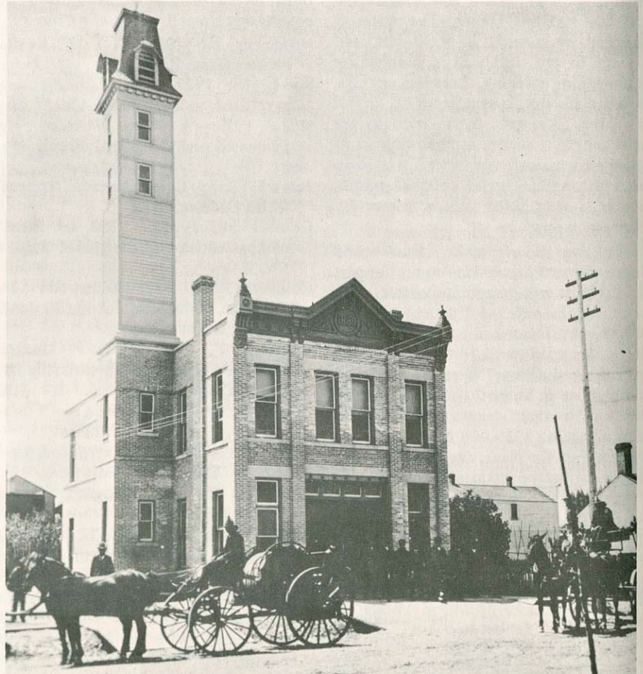
North Side Fire Station No. 1 – 1900