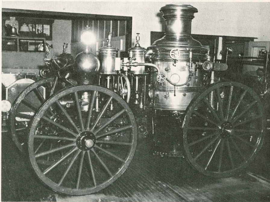
Water Tube Boiler made by American Fire Engine Co.

Meanwhile, firemen continued their losing battle with the roaring flames. Lack of water greatly hampered their