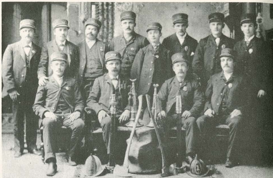
First Fire Fighters — 1883