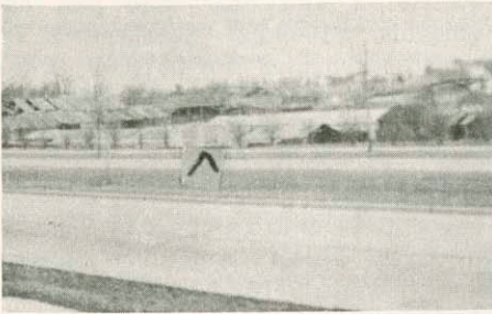
View from 6th and Waldo Blvd., looking southwest. Tunnel under guard rails in center of picture, (see arrow). About 1936.

bricks at that time. From then until November 8, only $147.07 was paid for labor.