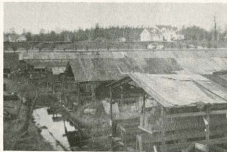
Pine Street looking north. Drying sheds are seen in this picture. Belsen home is in the background. About 1936.