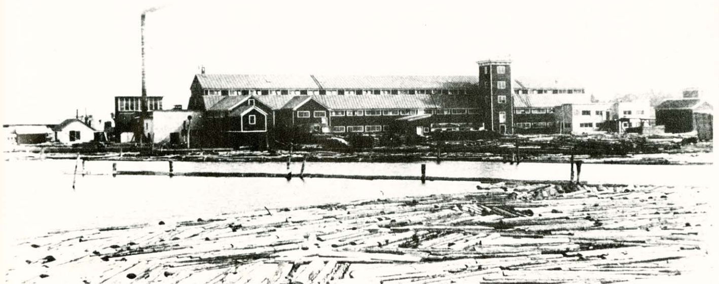
Mann Bros. Tub & Pail Factory on Walnut Street, Two Rivers. Circa 1895.