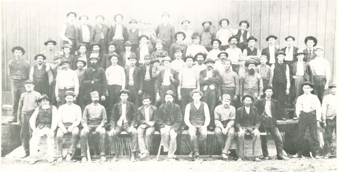
Saw Mill crew sit for a picture around 1895 at the Mann Bros. factory.

The strike lasted 11 days. The strikers held firm in the face of several demands from the company for partial cash payments. Finally on September 9, the strikers reached agreement with the company. All the demands were met.