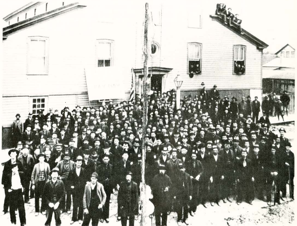
Strikers at the Two Rivers Turner Hall during "Pay Day" strike against the Mann Company.